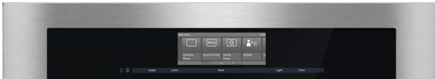
M Touch controls for easy navigation with the swipe of the screen