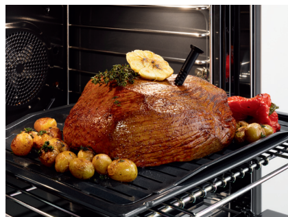
Wireless Roast Probe